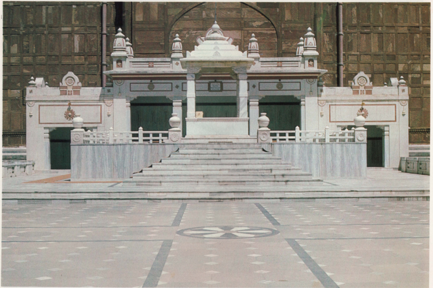
In Mathurā, India, this temple marks Kṛṣṇa-janmāsthāna , the site of Lord Kṛṣṇa's appearance in this world.